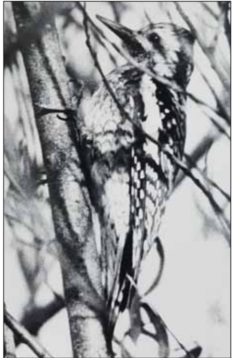
Yellow-bellied Sapsucker , Cotter's Garden, 19th October 1988.