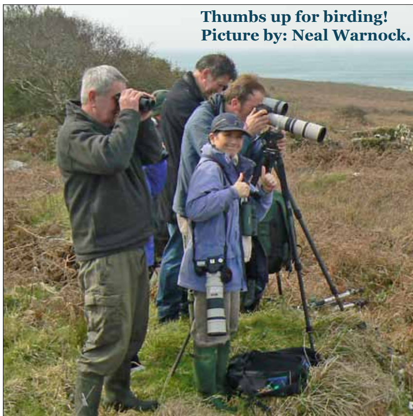
Thumbs up for birding!

Carry a notebook from the git-go and take notes on your sightings, their numbers and any other relevant information, e.g. date and times, weather, who else was present, location etc. Bird watching is a great way to work up an appetite, often when a good distance from any shops or take-aways. So a flask and some grub for these occasions does not go amiss.