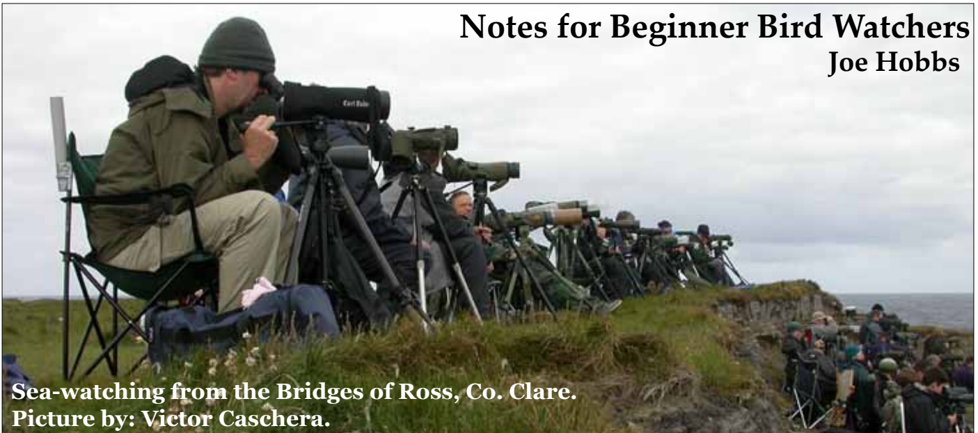
Sea-watching from the Bridges of Ross, Co. Clare.