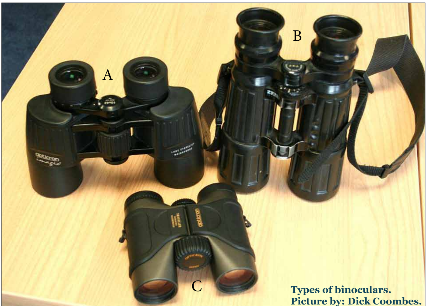
Types of binoculars.

Store your bins sensibly out of sunlight preferably with the lens caps on and in their original case.